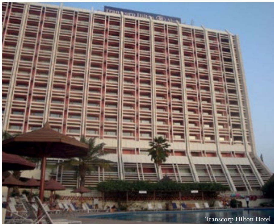
Transcorp Hilton Hotel