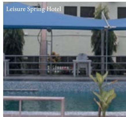
Leisure Spring Hotel