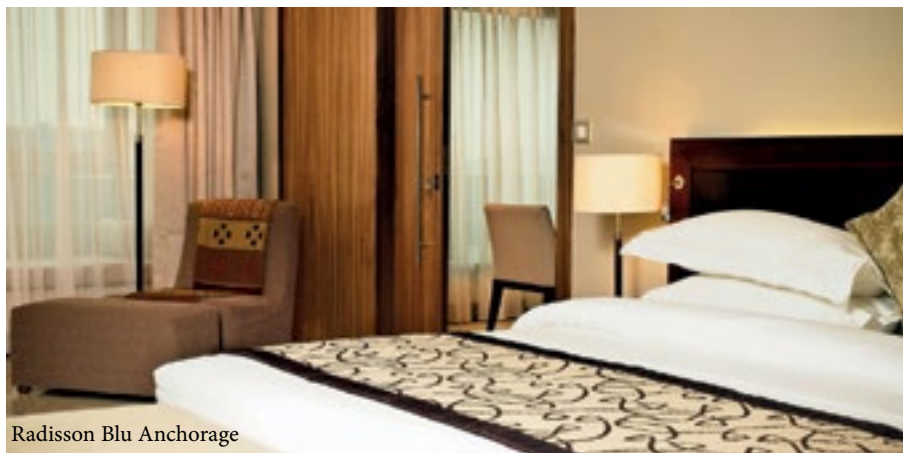
Radisson Blu Anchorage

This is another Protea offering in Lagos, very nicely located with views of the Kuramo Lagoon. The 60 rooms and suites are arranged in red-tiled blocks and have TV, cool tiled