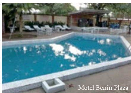
Motel Benin Plaza

10 Tudun Wada Road Tel: +234 73 455300-2, 455398, 454817, 45808 Website: www.hillstationhotel.com