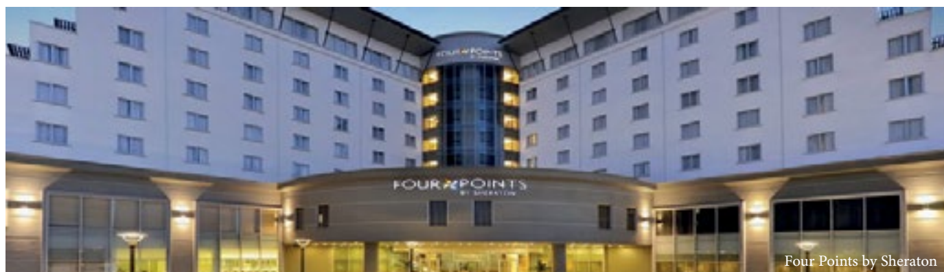
Four Points by Sheraton

Conveniently located near the airport, this large hotel has 332 newly-refurbished rooms and the extensive facilities include a business centre, ballroom, tennis courts, mosque, swimming pool, various conference halls and several top-notch restaurants. In the lobby are desks for airlines and car rental agencies. 30 Mobolaji Bank Anthony Way, Ikeja Tel: +234 1 280 0100-300 Website: www.starwoodhotels.com