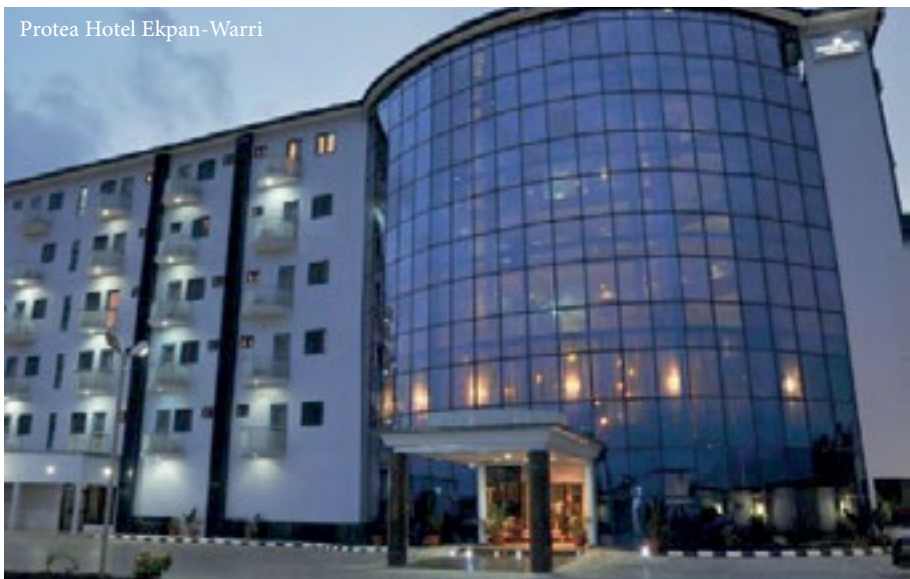
Protea Hotel Ekpan-Warri