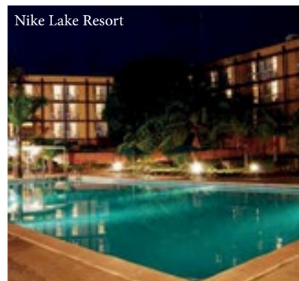
Nike Lake Resort

course, tennis courts, gym, large swimming pool, bar and restaurant.