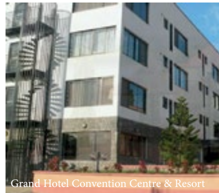
Grand Hotel Convention Centre & Resort

This relaxing resort is 8 km from Enugu off the Onitsha–Abakpa road and is set on picturesque Nike Lake, which offers rowing boats and short walking trails through the bird-filled surrounding forest. Now completely refurbished and run by African Sun Hotels, it has 210 luxury rooms and there's a mini-golf