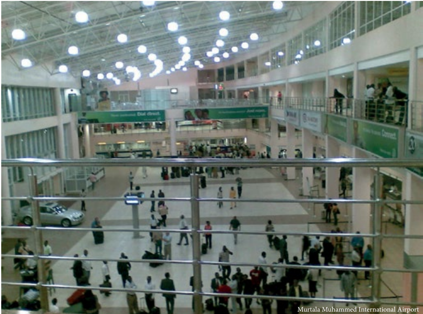
Murtala Muhammed International Airport

with Air Operator Certificates issued by the Civil Aviation Authority of Nigeria