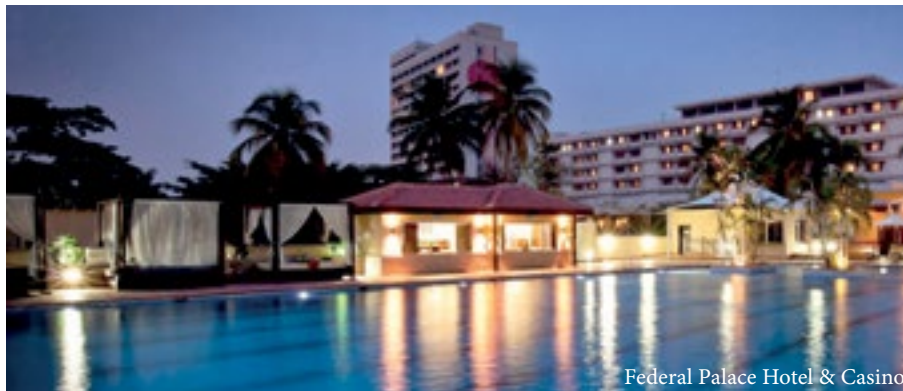
Federal Palace Hotel & Casino

Website: www.radissonblu.com/hotel-lagos