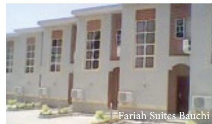
Fariah Suites Bauchi

12 Club Close, GRA Tel: +234 807 567 1223 Website: www.fariahsuites.webs.com